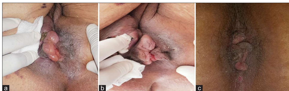
Figure 2: Post-operative (a) day 7 follow-up (b) day 14 follow-up and (c) 6-week follow-up